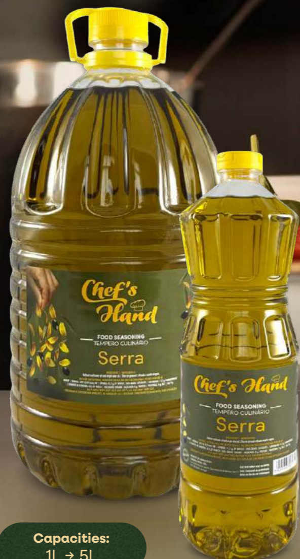
Capacities: 1L → 5L

Chef's Hand reflects a passion for cooking and a commitment to quality that inspires both professional chefs and home cooks alike. Present in a range of condiments and olive oils that celebrate the best of food production, Chef's Hand is the choice for those seeking a touch of excellence in every meal —as if the chef himself were lending a hand.