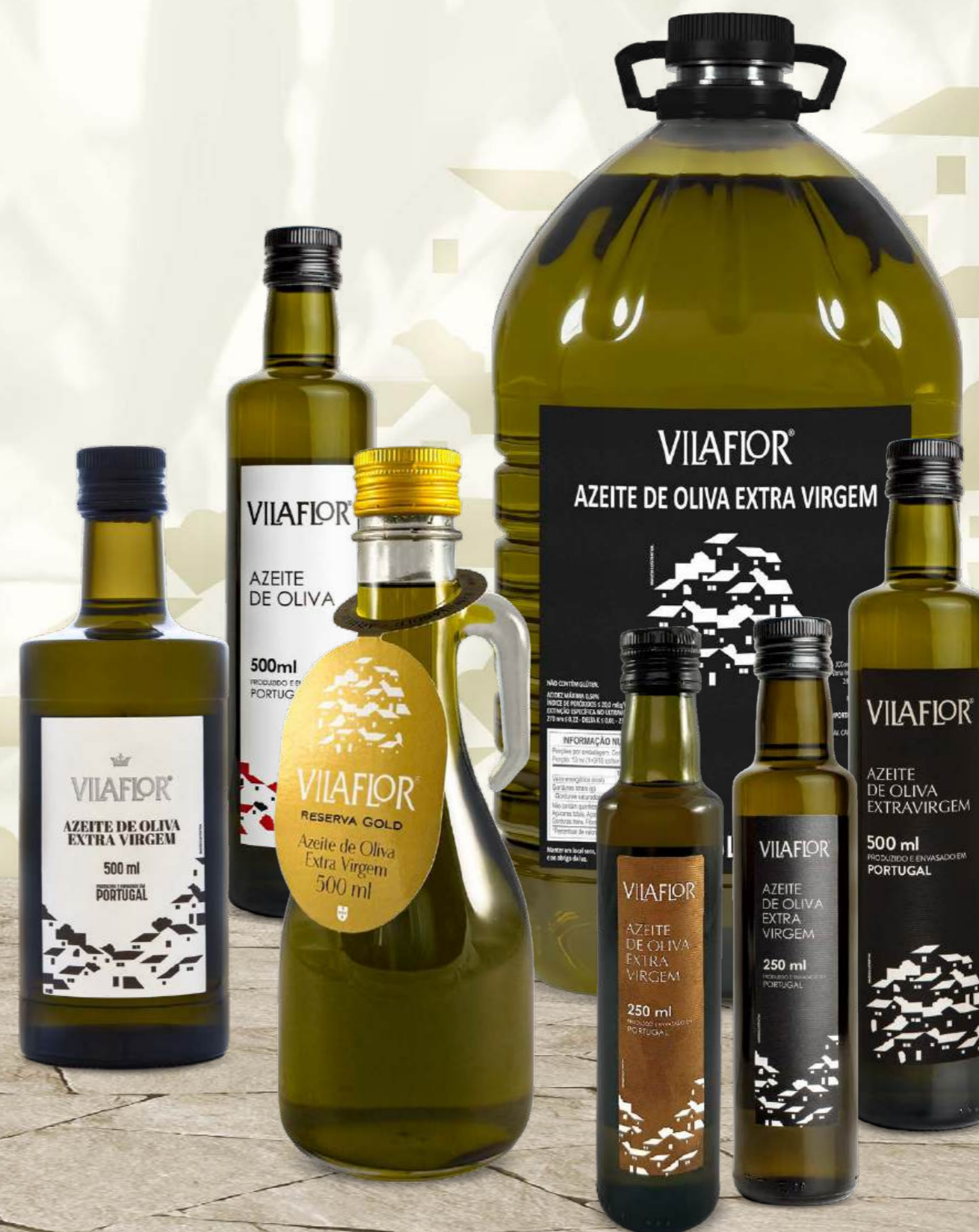
Capacities: 250ml → 5L

VilaFlor represents the most refined expression of the Portuguese olive oil tradition, distinguished by its lightness, amber hue, and fruity aroma. The olive trees grow in a region of hot, dry summers and cold winters, with wide temperature variations and strong continental influence—conditions that give the olive oil a distinctive, well-balanced character, deeply rooted in the authenticity of the Trás-os-Montes land.