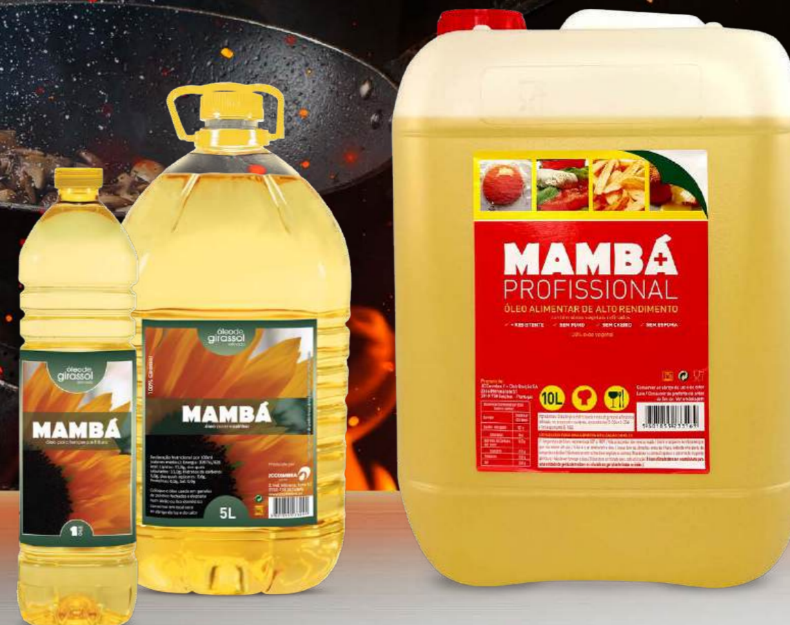
Capacities: 1L → 10L

Discover “Mambá”, a brand crafted for professional use, bringing consistency to every dish.