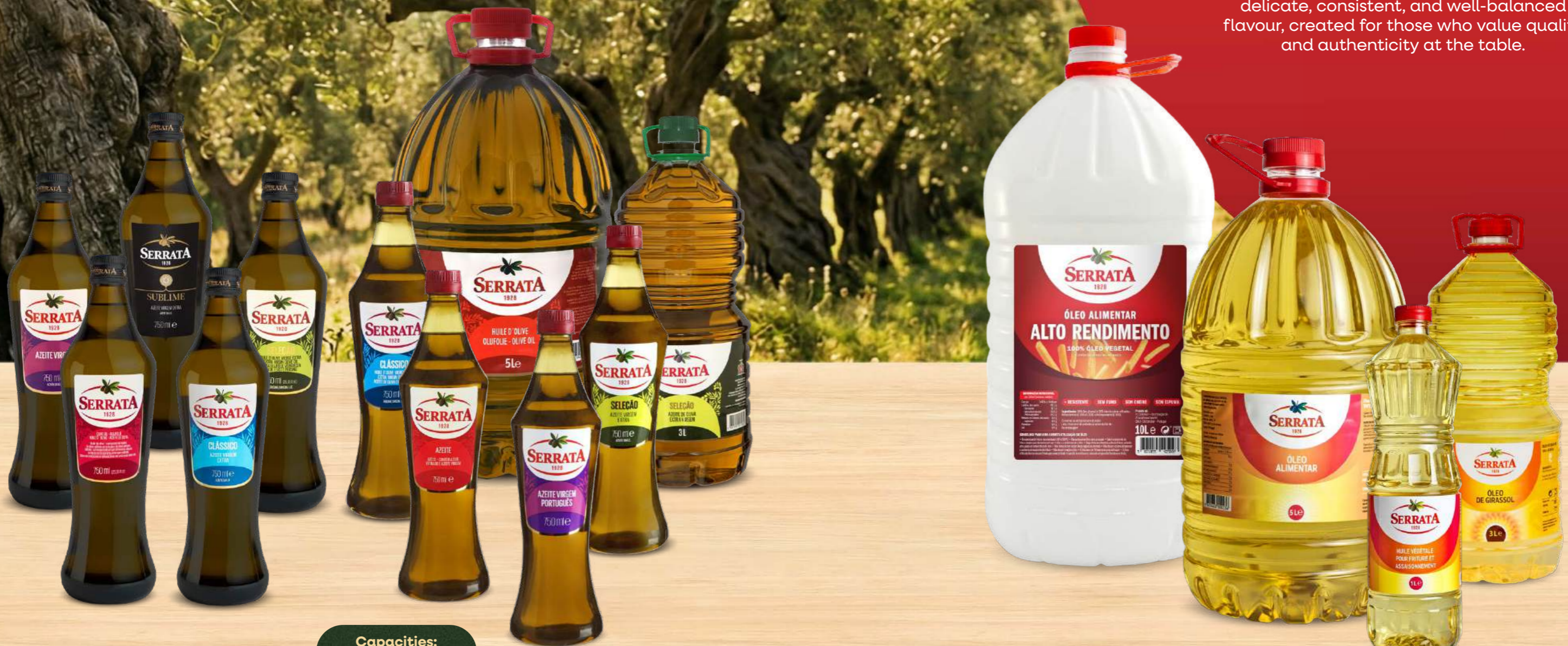
Capacities: 250ml → 10L

Serrata has preserved the tradition of the purest Portuguese olive oil since 1928, combining experience, precision, and knowledge passed down through generations. The olives are carefully harvested with respect for time-honoured practices, resulting in an olive oil with a delicate, consistent, and well-balanced flavour, created for those who value quality and authenticity at the table.