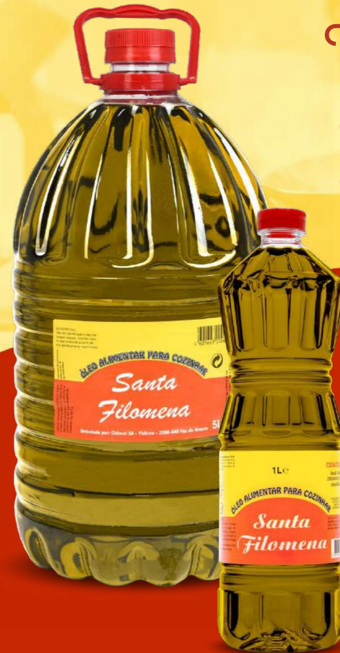
Capacities: 1L → 5L

Flavour and reliability for everyday cooking