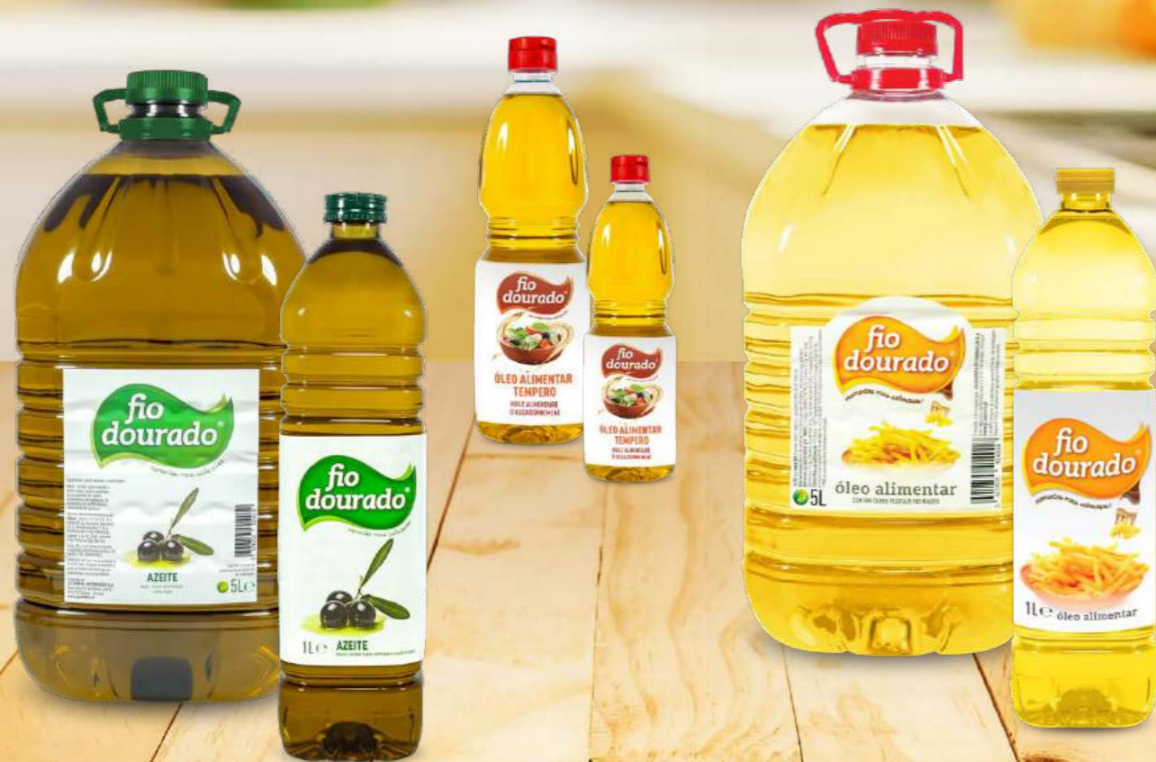
Capacities: 500ml → 5L

Different solutions for everyday cooking.